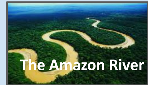
The Amazon River