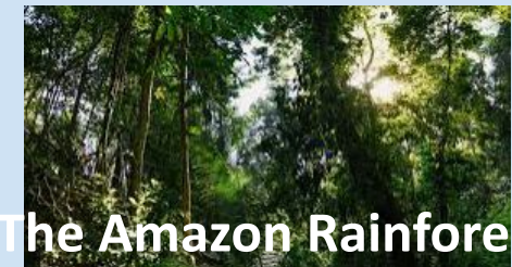
The Amazon Rainforest