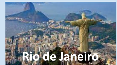
Rio de Janeiro