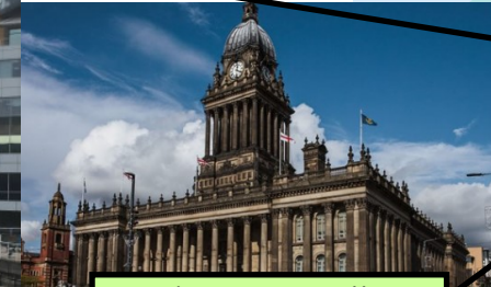
Leeds Town Hall