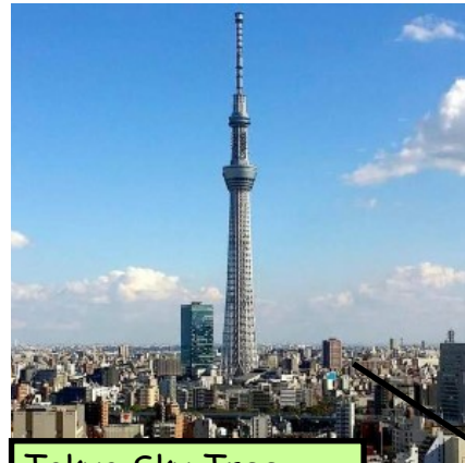
Tokyo Sky Tree