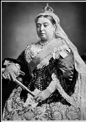
Queen Victoria 1819-1901