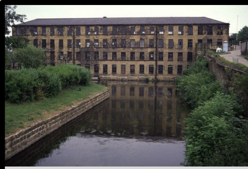
A mill building located in Armley